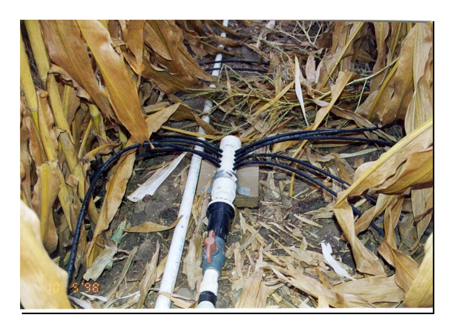
Figure 2. Flow divider used to supply water to 9 individual furrow basins for the purpose of simulating LEPA sprinkler irrigation.

The SDI system was disconnected for the plots associated LEPA treatments during the season to prevent any water application by SDI. The simulated LEPA treatments were accomplished by setting up a surface PVC pipe down the 81 ft length with pressure regulated flow dividers for each 30 ft increment. Each flow divider (Figure 2) had 9 equal length supply tubes (0.25 inches ID) delivering water to 9 individual furrow basins. Furrow basins were approximately 9 ft in length and were constructed in the furrows. The amount of water necessary to apply the one-inch application to the LEPA plots was calculated from the number of flow dividers and supply tubes in relation to the land area covered (3 flow dividers with 9 tubes each covering 81 ft of plots and 15 ft of width [3 furrow basins]). The application rate of the simulated LEPA irrigation treatments was approximately 1.5 in/hour which would nearly match the application rate of typical LEPA irrigation in the region. Furrow basins were used to retain applied water until it could infiltrate into the soil. Furrow basins are an integral part of the LEPA system and practices.