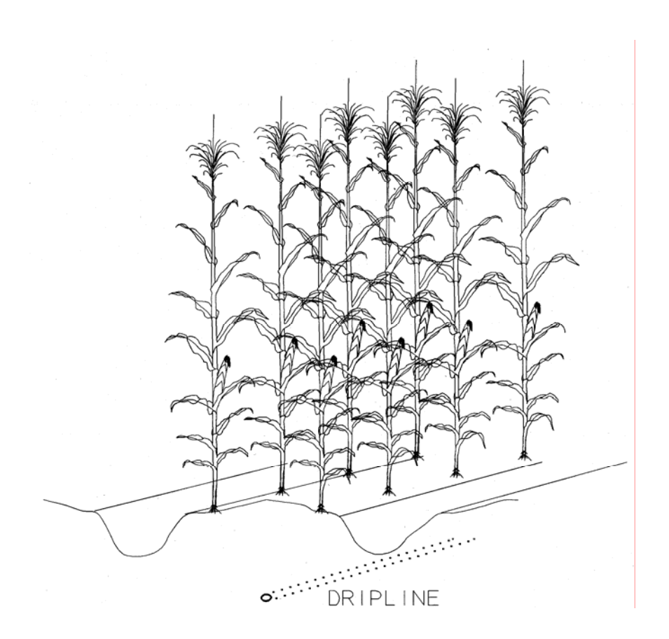
Figure 1. Physical arrangement of the subsurface dripline in relation to the corn rows.

The study utilized an SDI system installed in 1989. The dual-chamber thin-walled collapsible dripline was installed at a depth of approximately 16-18 inches with a 5-ft. spacing between dripline laterals. Emitter spacing was 12 inches and the dripline flowrate was 0.25 gpm/100 ft. The corn was planted so that each dripline lateral was centered between two corn rows (Figure 1). Each plot was instrumented with a municipal-type flowmeter to record total accumulated flow. Mainline pressure entering the driplines was first standardized to 20 psi with a pressure regulator and then further reduced with a throttling valve to the nominal flowrate of 2.89 gpm/plot, coinciding with an operating pressure of approximately 10 psi.